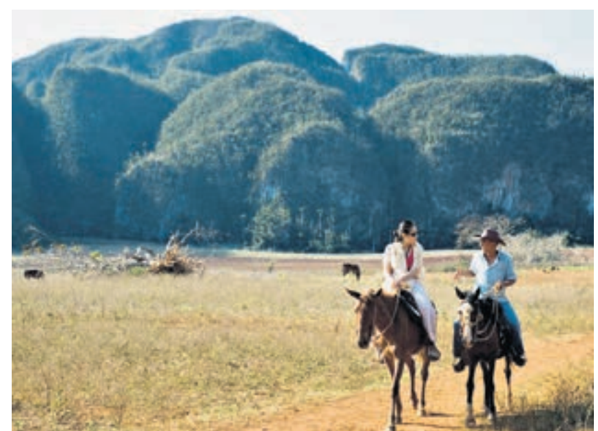
A Saddle up and explore the Valley of Viñales for a taste of the Wild West, Cuban style

Dig a little deeper, escape Havana and the tourist spots with these three regional trip ideas, and you can experience the island as the locals do. But do bear in mind that straying off the beaten path means arranging things for yourself, being flexible, bringing lots of cash (sterling or euro), and getting a sim card on arrival (£22) from nationwide provider Etecsa for data on the go rather than patchy, commonly al-fresco Wi-Fi (etecsa.cu/telefonia_ movil/cubacel tur).