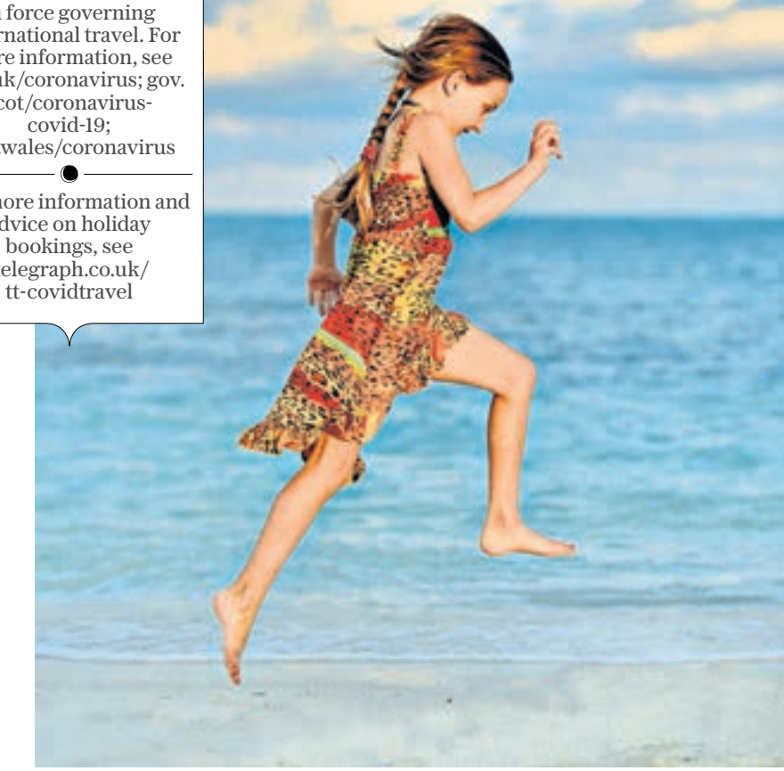
▲ There are plenty of reasons to jump for joy in the family-friendly destination

For more information and advice on holiday bookings, see telegraph.co.uk/